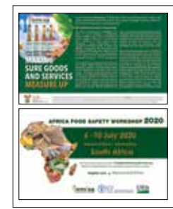
HALF PAGE AD