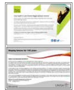
HALF PAGE AD