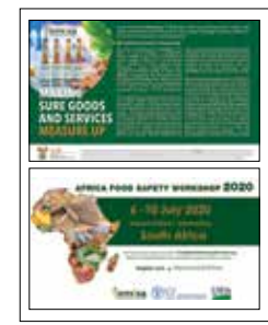
HALF PAGE AD