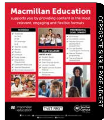
210mm x 275mm CORPORATE SINGLE PAGE ADVERT