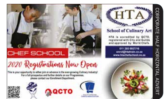
200mm x 128mm