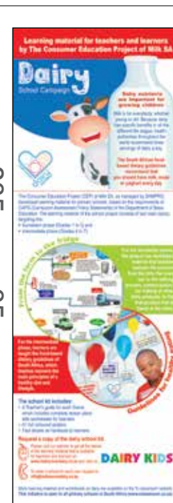
CORPORATE HALF VERTICLE ADVERT