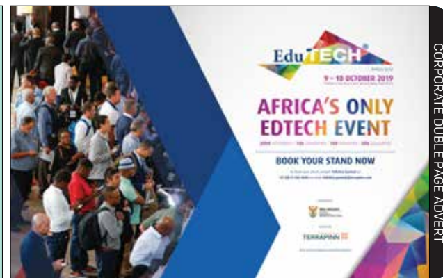
420mm x 275mm CORPORATE DOUBLE PAGE ADVERT