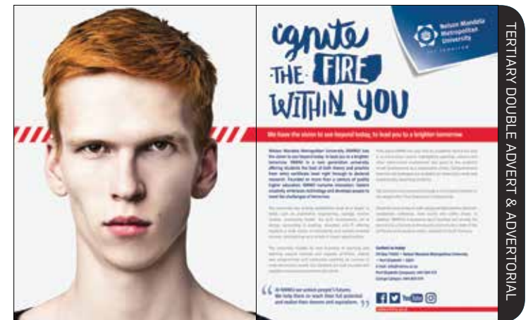
TERTIARY DOUBLE ADVERT & ADVERTORIAL