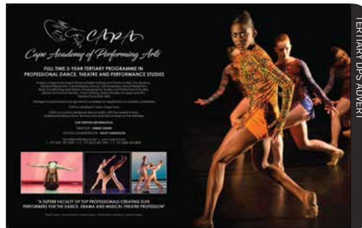
TERTIARY DPS ADVERT